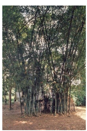
A bamboo grove, Zorzor

with what was left of the leper's hands. He was pleased with being cured, apart from the permanent injuries.