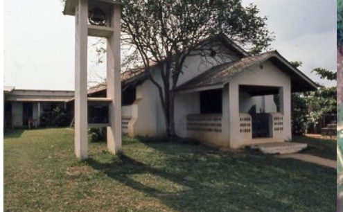
The Lutheran church in Zorzor

The Curran Lutheran Hospital is located on the left side of this 2018 Google Earth satellite image, beside the village of Zorzor.