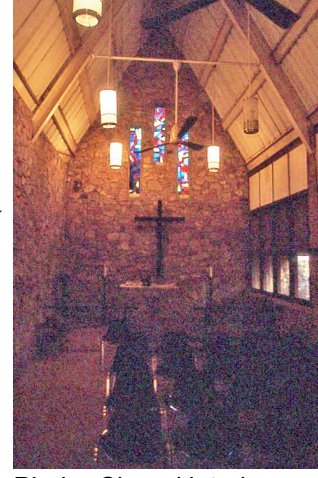
Phebe Chapel interior