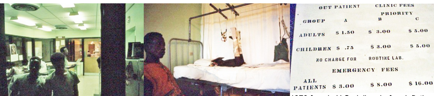
Nurse's station at + intersection of halls Father with son in traction

1970 fees in U.S. dollars before inflation