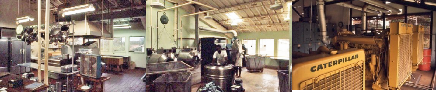
Kitchen Laundry Three power generators