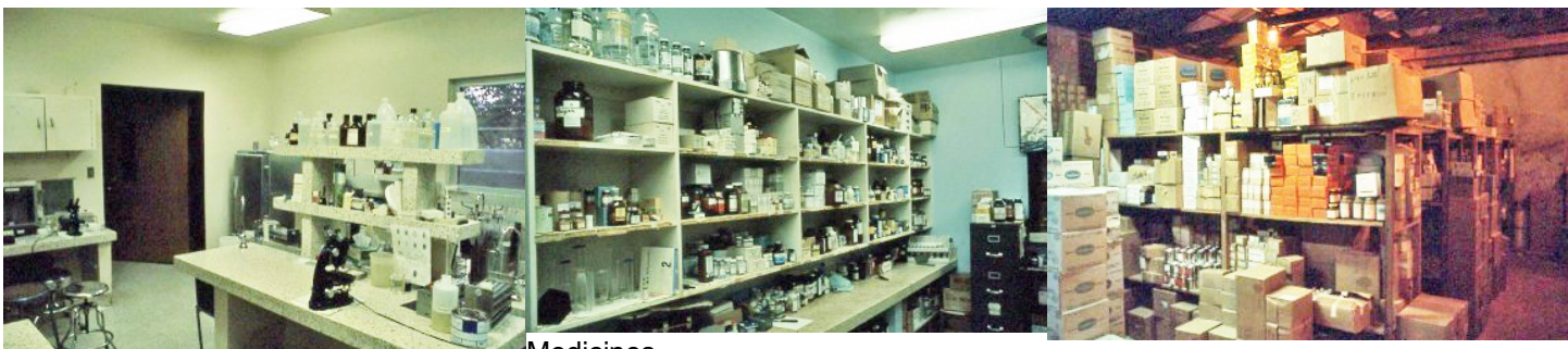
Lab Supplies in warehouse