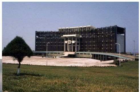
Executive Mansion of Liberia, Monrovia

We were shown a plantation of rubber trees ( Hevea brasiliensis ), native of Brazil but now grown in other tropical areas, for latex production which is used to produce rubber. The bark is carefully cut diagonally to intercept the latex vessels that spiral to the right up the trunk. The oozing latex falls into a cup for harvesting later in the day. Latex that coagulates on the bark or falls to the ground is still useful but must be cleansed of contaminates. Sheets of coagulated latex are shipped to industrial factories around the world to create many products.