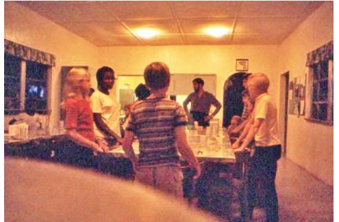
Missionary children in a youth hostel

When we were there, Lutheran Bible Translators had been working on two local languages. They produced many booklets to provide reading materials so that people could practice reading their language which had recently been produced in a written form. The language characters were phonetic so that anyone could pronounce the language even if they did not understand it. That let the Lemmermans coach their students to read in their own language. By recent years other languages have been put in written form and portions of the Bible and entire Testaments have been produced, with more in production as resources become available.