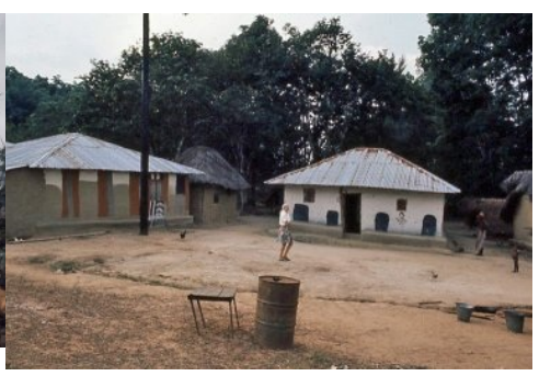
Mrs. Lemmerman and finished homes

Local home construction starts with a wooden frame. Then mud is thrown at the frame to build up the walls. The roof is either sheet metal or thatch (in rear). Decorated homes like these are rare.