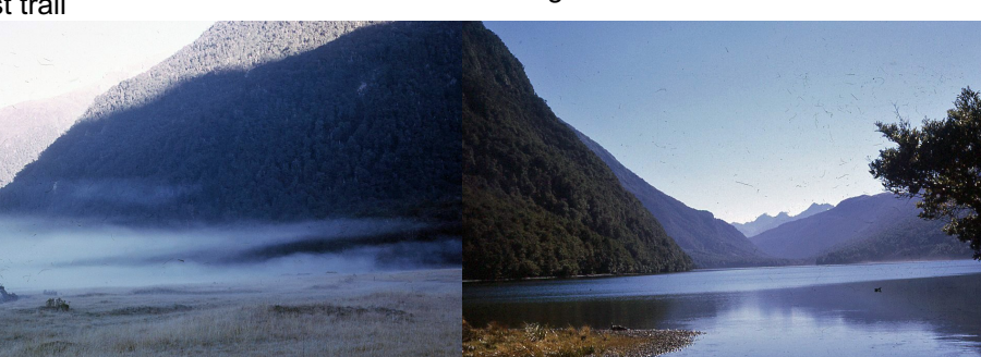
pond at Cascade Creek campsite

We had all of this restful beauty to ourselves that overnight and morning. Then onwards to Mount Cook area.