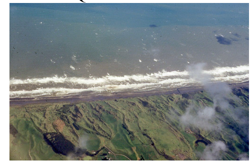
Perhaps old earthquakes lowered the landscape, drowning former beaches and creating the double breaker waves on the west side of North Island.

We drove back to Auckland and flew south to Christchurch, then a different plane to Queenstown on the South Island. The map shows aerial photo centers as red dots. The thin yellow line shows our roads south and west of Queenstown.