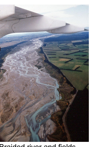
Braided river and fields north of Christchurch.