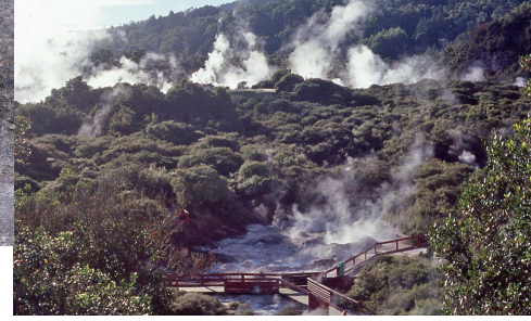
hillside hot springs and geyser area