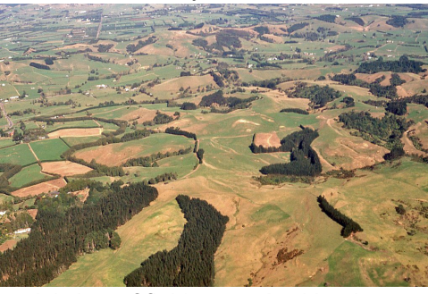
aerial view of fields near Auckland

As mentioned in the 1974 Trip Report, Rotorua is the third