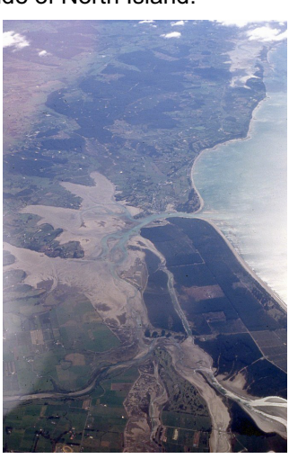
This shoreline and bay is on the northern end of South Island just west of the city of Nelson.