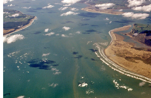
aerial view of a bay north of Auckland

Our first stop was the city of Hamilton where we stayed overnight. That evening I showed my exhibit of Biblical period coins at a church. As I recall, a local coin collector group joined the event. See <a href="https://www.EdHolroyd.info/biblicalcoins">www.EdHolroyd.info/biblicalcoins</a>. The next day we drove to Rotorua.