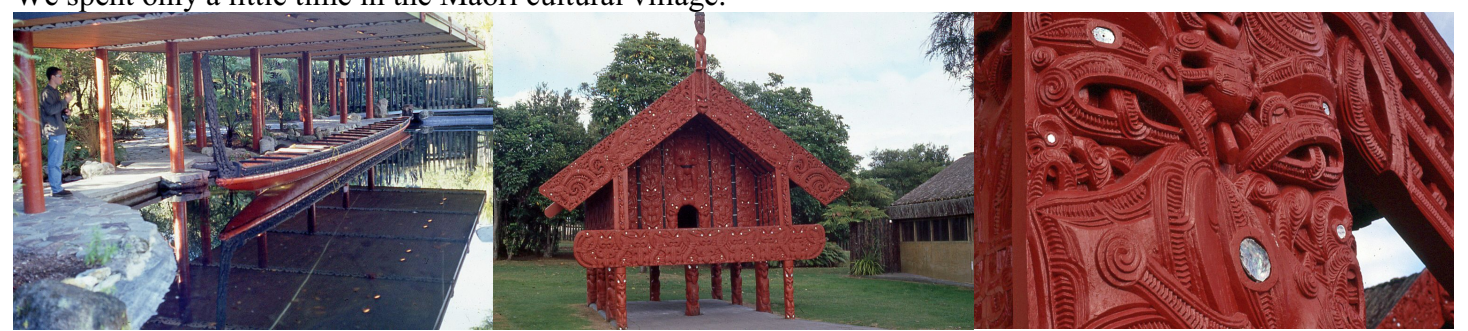
Micah viewing Maori boat

We spent only a little time in the Maori cultural village.