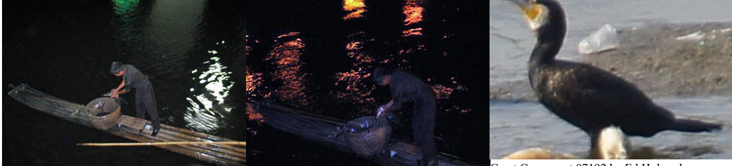
9473 extracting fish from bird, by Jim Gu