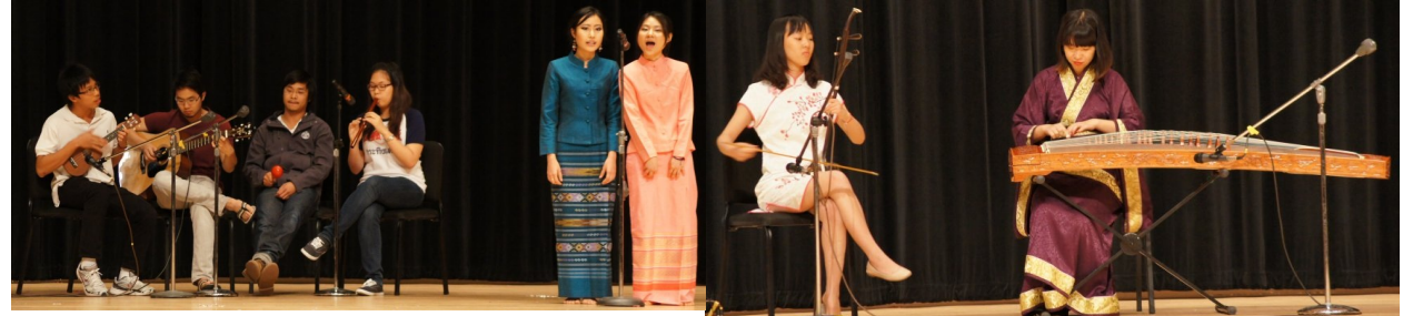
Singers from Thailand