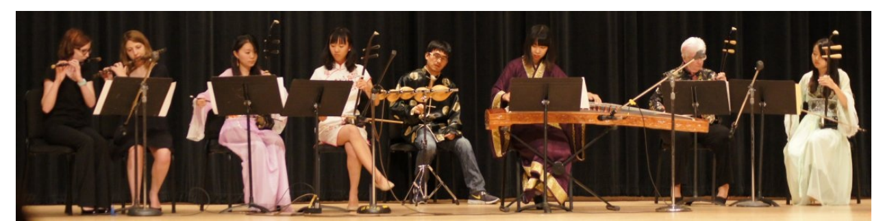
An orchestra of traditional Chinese instruments