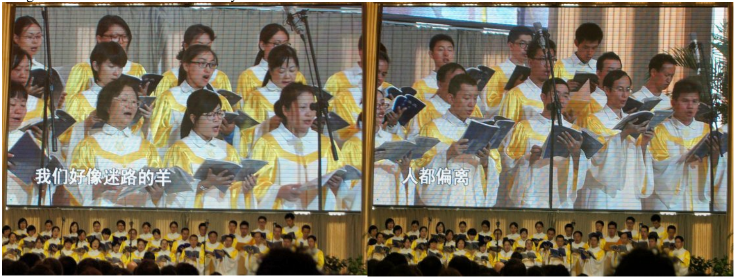
Notice the relatively young faces. This church is in a university and technical and professional part of the city.