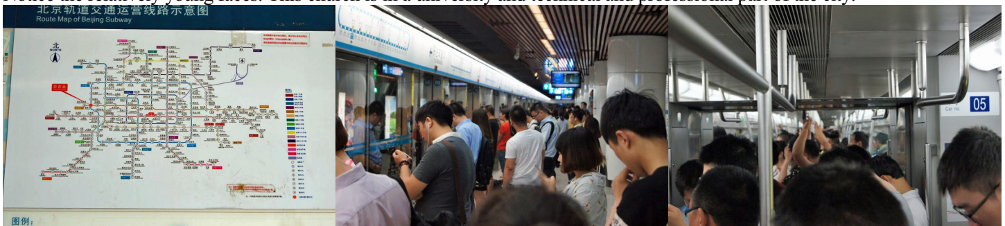
Thursday morning I went alone by subway from the west side (red marker on the route map) to the northwest corner of the system to the Summer Palace. I had been to the Summer Palace two other Summers, but always with a group. The middle photo shows people waiting for the subway train shortly after 8 AM on this work day. There was less than standing room only as we were all pushed together inside the subway cars. Later the crowd thinned enough that I could raise my camera above the heads for a view inside the subway car. The trip took more than an hour each way. Coming back there was plenty of room and I got back to the neighborhood of our hotel near noon and had lunch in a park.