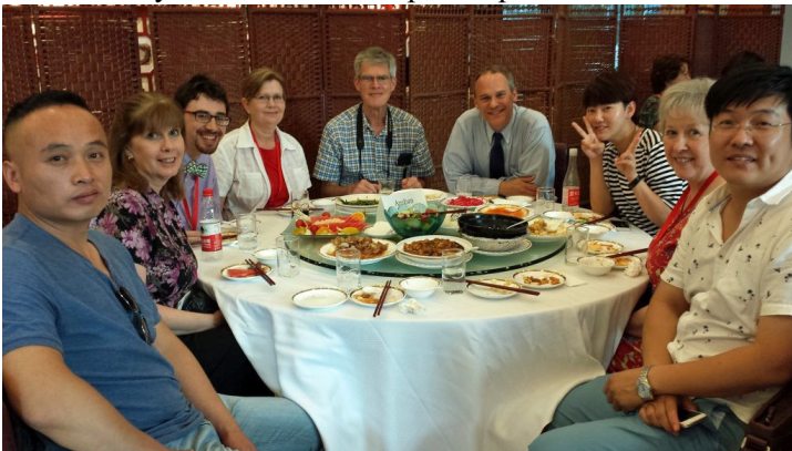
Our Anshan team and Chinese hosts from Anshan. The teacher on the right will be the student monitor (leader) in my class.