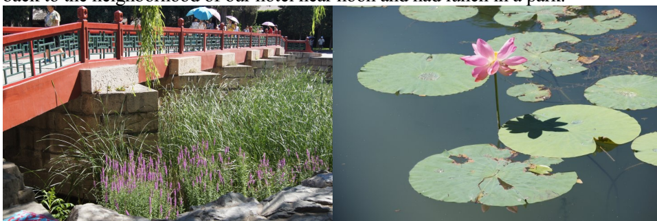
I found a patch of purple loosestrife in the Summer Palace park and some lotus plants. Loosestrife is normal in Europe and Asia, but it is a beautiful noxious invasive weed in North America because it has no natural enemies in America.