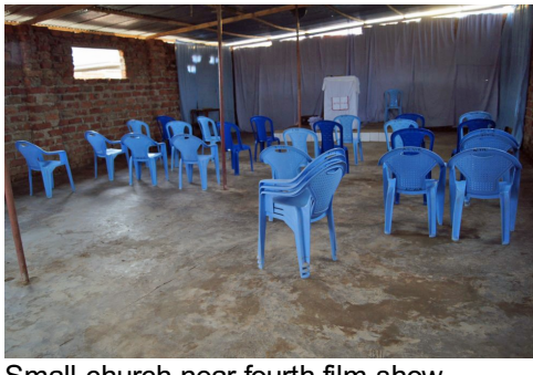
Small church near fourth film show