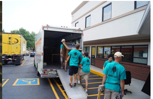
loading the trucks

These new international students arrive in our country with only what they can carry in their luggage. They need to equip their apartments, and this event helps with their needs. It is greatly appreciated. There are also stores in the area that sell used clothing for very cheap prices. Many students from warm countries need adequate clothing for the cold winter season in Colorado. We volunteers also get to make new friends with the students.