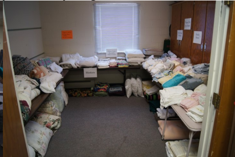
free bedding and towels