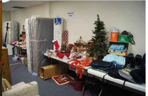
bed mattresses and other items

New students usually arrive early before the 1:30 PM official opening and form a long line. The first students get the best choices while the last students select from what has not already been claimed.