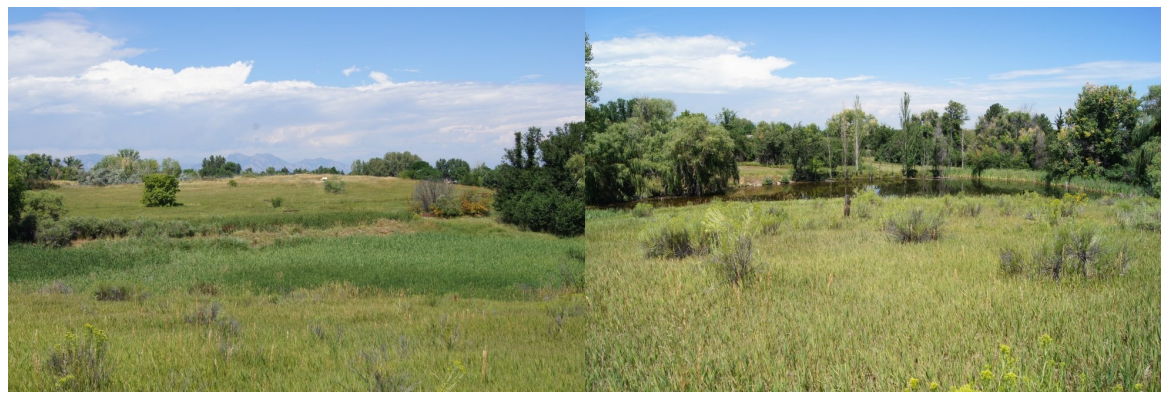
View west northwest over third pond and cattail swamp, with mountains in the rear.

On Tuesday I was again a volunteer at Two Ponds National Wildlife Refuge in Arvada, Colorado. (There are actually three ponds.) On the second Tuesday of the warm months several volunteers work under the