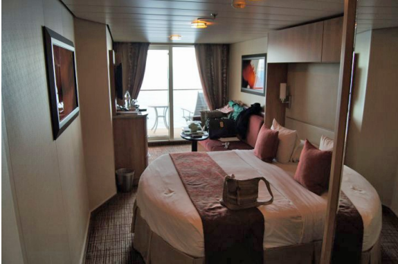
Our bedroom, towards balcony