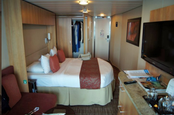
Our bedroom, towards door