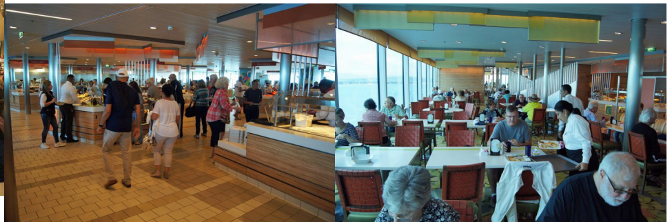
Self-serve dining, all day.