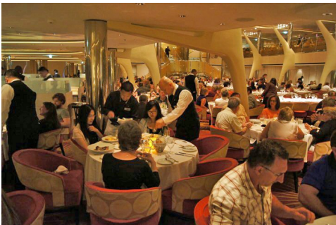
Formal dining room and waiters

There were many small specialty restaurants but we did not use them.