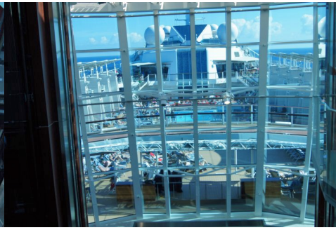
View over pools, lounging decks

The ship had many stores for shopping for expensive items. It had a gambling area. There were many bars for alcoholic beverages. We did not use such facilities.