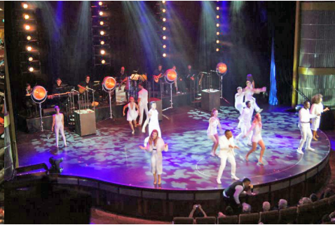
Song and dance