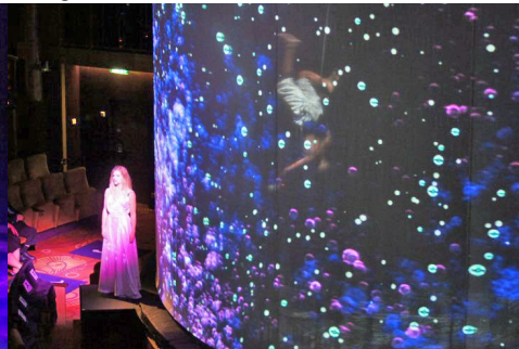
Simulated under-water actors on ropes