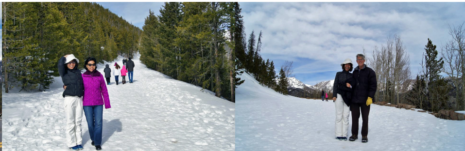
Qian and Natalie on unplowed road