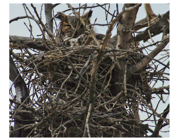
Great Horned Owl on nest