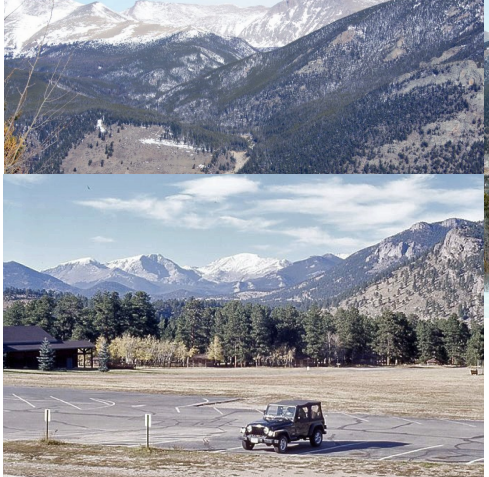
2005 view from YMCA camp

We drove up the highway until we reached the road closure, beyond which the snow had not been removed. We then walked beyond along the snow-covered road for about a kilometer before returning.