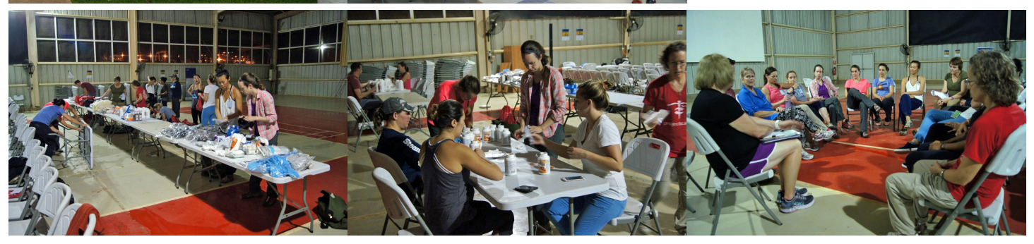
Sunday evening sorting of supplies and pills, followed by a team briefing meeting.