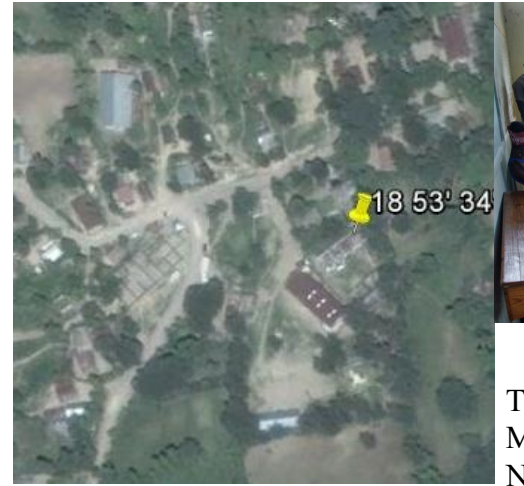
satellite view of Roy Sec