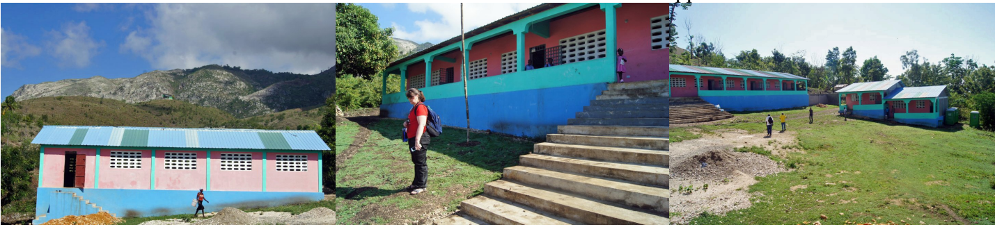
to West: chapel/dining-hall/kitchen

The third and fourth clinics were held on 27 and 28 April, west of Mirebalais, northwest of Saut d'Eau, at a community unofficially called Nordette. The end of the road to there was impassibly muddy. We had to walk the final 475 meters with our supplies. Satellite view: 200 m wide.