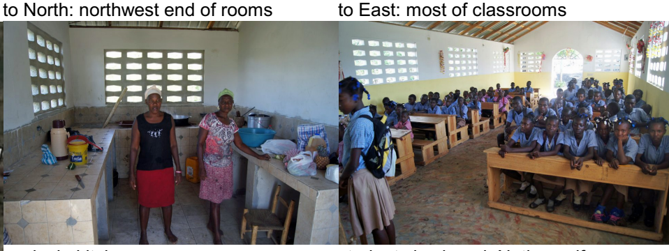
cooks in kitchen students in chapel. Notice uniforms.

This sampling of three rural schools appears to show simple facilities for mostly elementary age students. Some of the chalkboard lessons may be at a higher level.