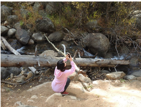
Shuangfeng records beautiful trees.