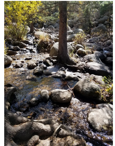
The mountain stream