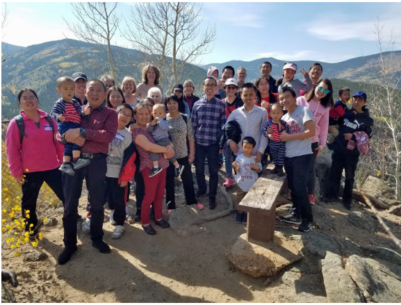
After many photos we gathered around a picnic table for mid-afternoon snacks.