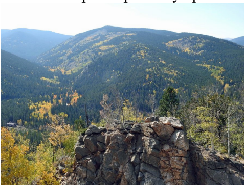
Yellow aspens among evergreen trees.

Our next stop was part way up the mountain slopes to an overlook.