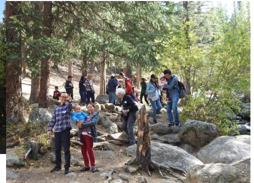
Returning to the vans

Our next stop was part way up the mountain slopes to an overlook.