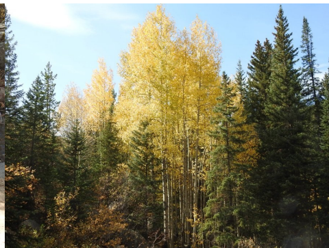
The trees in her view.