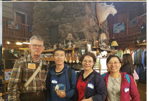
As expected, a small flock of Canada (Gray) Jays was eager for a free snack. We had been at the far side of this lake. Inside Echo Lake Lodge.