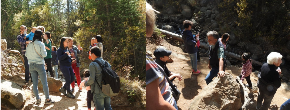
Gathering beside the stream