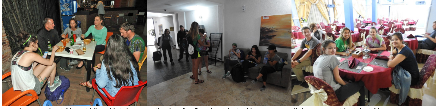
evening snack at Airport View Hotel