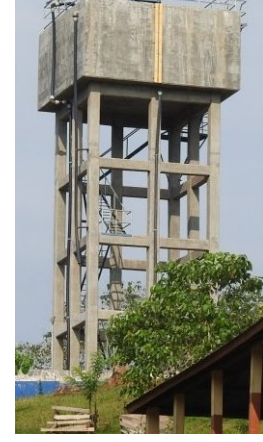
water tower on hilltop

suburban style layout with full utilities in the houses. The fourth clinic was held in a common area under a shelter built after the satellite imagery was taken.