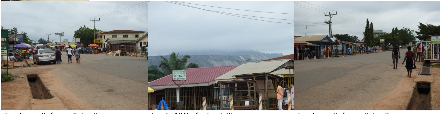
view to south from clinic site

Monday morning we arrived at the town center, the site of our first two days of clinics.