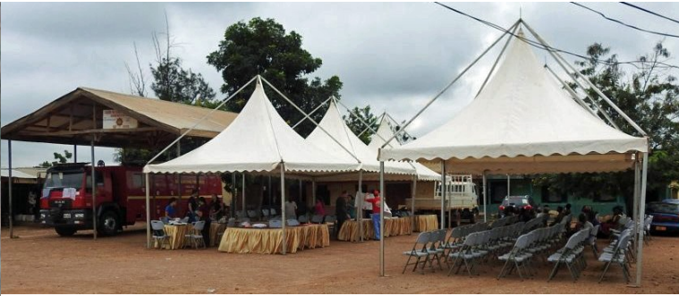
New Abirem clinic tents beside fire truck shelter.

Newmont supplied the tents, tables, and chairs at the town center for the first two days of clinics. As the first day progressed we changed our table arrangements. Local