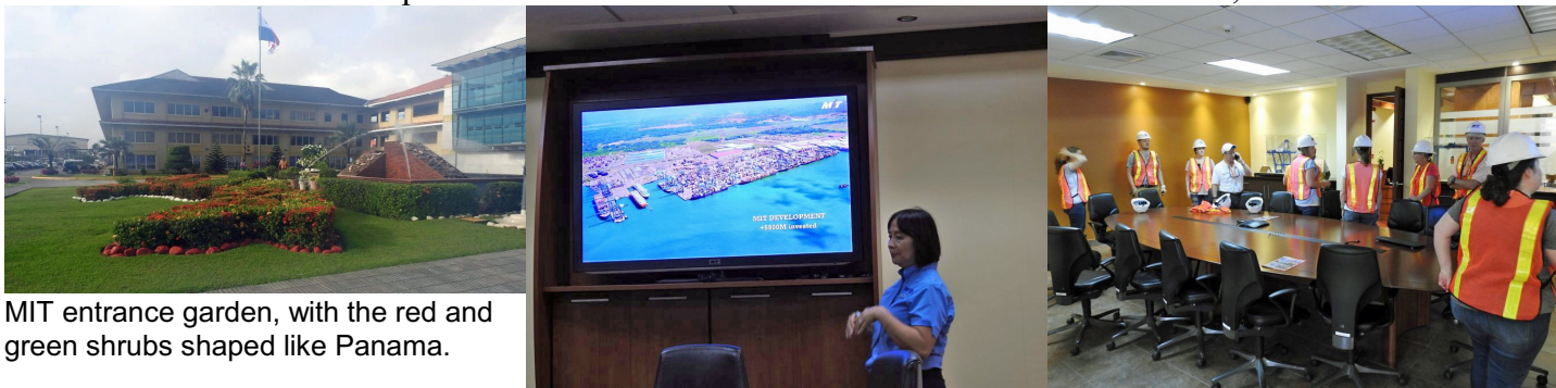
green shrubs shaped like Panama.

On Friday, 10 August, after our four days of clinics, our team was treated to an adventure at the port facilities of Manzanillo International Terminal Panama, whose dorms we used.