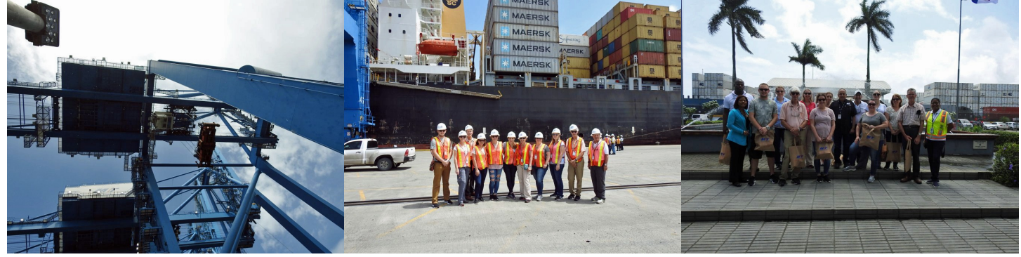
Looking up at where we had been.