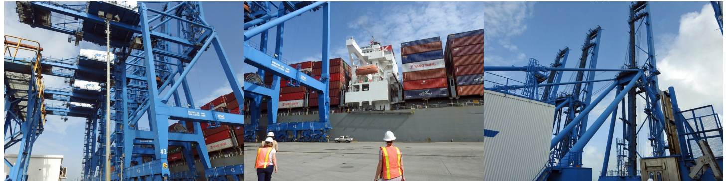
4 giant cranes move shipping containers such as onto this departing ship.