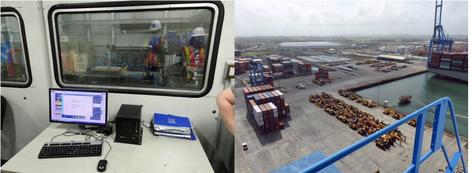
In room for equipment status and display View inland from crane

The original photo size shows our MIT dormatory behind the ship and crane in the upper right. Stacks of containers are on the left, yellow construction equipment in the center and a parking lot packed with white cars in the rear. The ship at the right was being unloaded and we could watch apparatus being lowered to grab a container, raise it, and deliver it to ground on the far side dock.