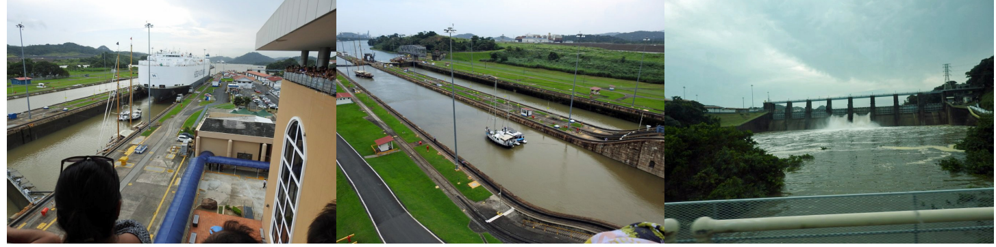
Ship entering Miraflores lock with others. Small boats leave first, pulled by ropes. Miraflores spillway.

Friday afternoon we went to near Panama City to visit the canal museum and old Miraflores locks.