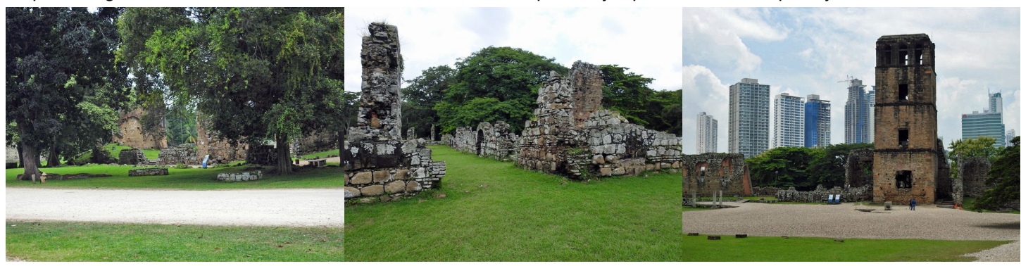
Visiting Panama Viejo's 1500s ruins and museum on Saturday morning.