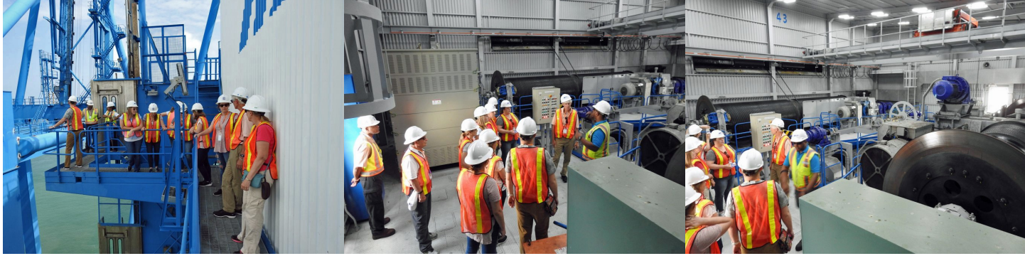
Our team at elevator top.

We rode a 4-person elevator to the white motor rooms 20 stories above the dock.