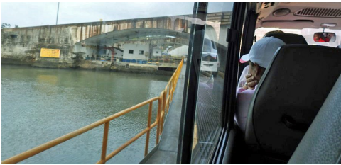
crossing old canal on bridge that rotates into place

traffic waiting to cross new canal We spent much time waiting to cross the canal by ferry or locks. The new bridge will be loved.