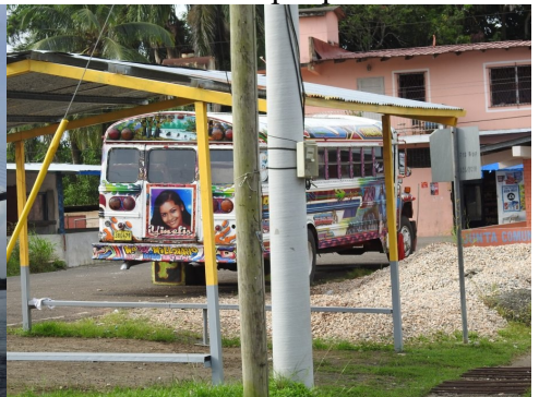
recycled USA school bus for local use