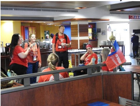
waiting for breakfast and prepared lunch