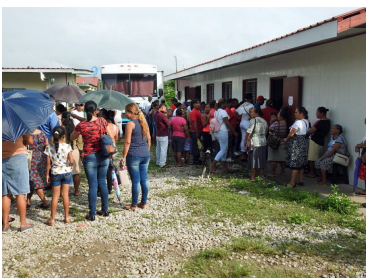
Ready for us to start our clinic.