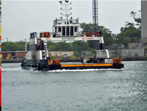
trading places with this empty ferry