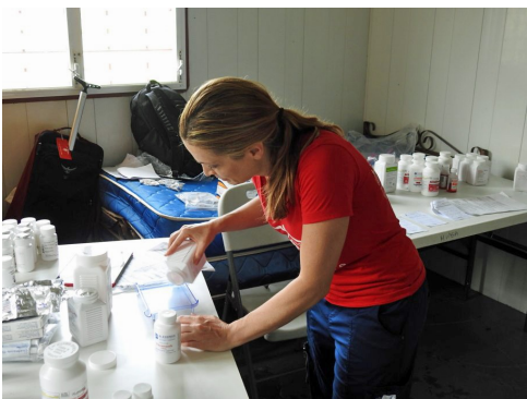
Amethyst at pharmacy