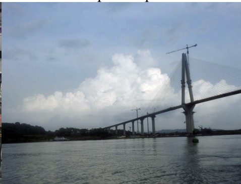
waiting for ferry