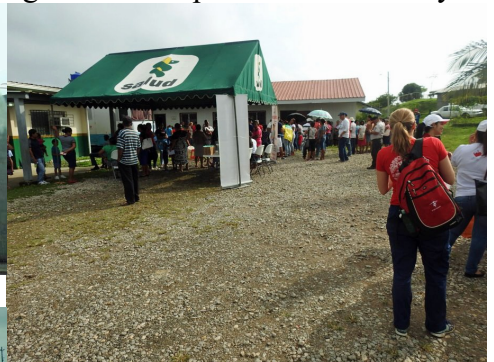
Escobar site at local clinic buildings