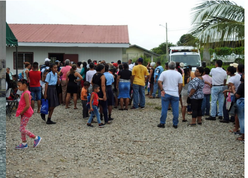
crowd waiting at Escobal on Thursday