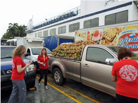
We bought fresh pineapples on ferry