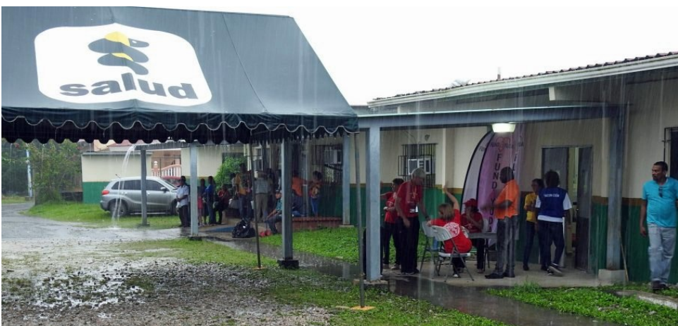
Vertical streaks are from intense early afternoon rain. Falling water near car.