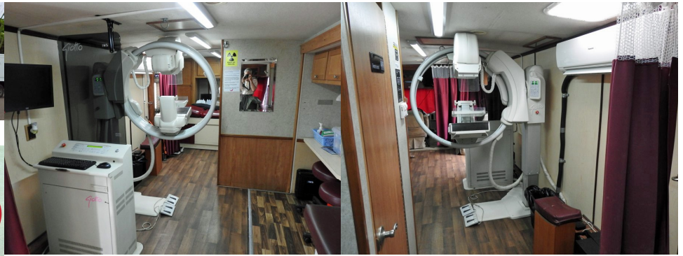
and provided mammograms, EKG, and other special health services.