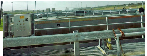
traffic crossing new canal on top of lock gates in parallel; ship in far distance

traffic waiting to cross new canal We spent much time waiting to cross the canal by ferry or locks. The new bridge will be loved.