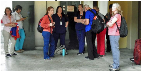
waiting again for breakfast