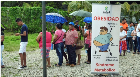
sign with obvious health message