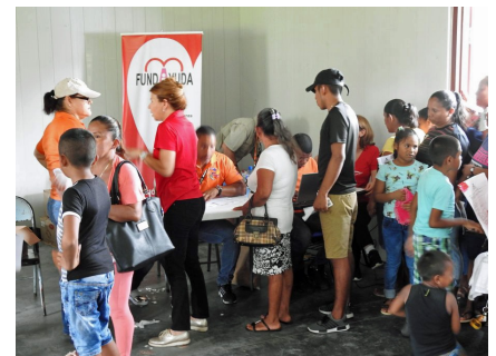
FundAyuda doing check-in