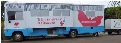
Special government imaging van and power trailer