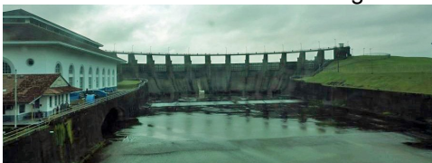
Gatun Dam, power plant