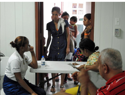
pharmacy check-in, government workers and supplies