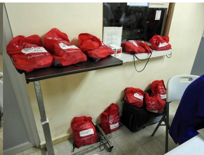
Crowd, Clyde at glasses, and supplies, sorted by strength