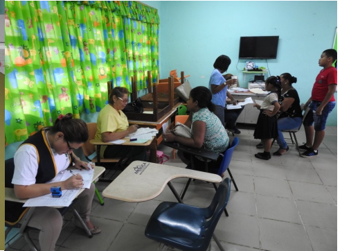
some of government doctors