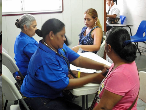
government blood pressure check