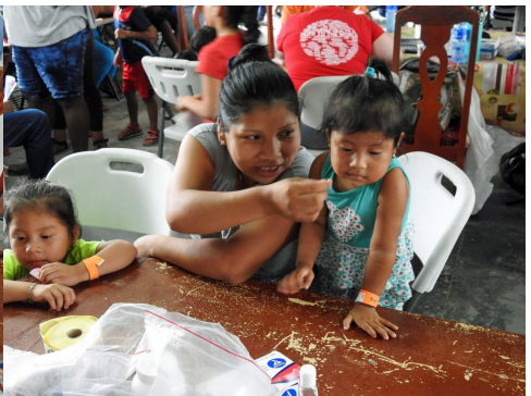
trying to feed de-worming tablet to child