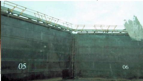
view of old Gatun locks from bridge