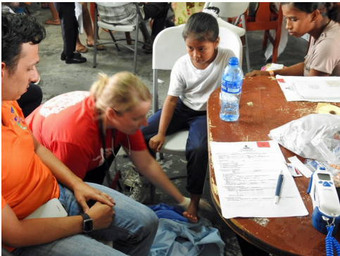
Meghan treating foot wound at triage