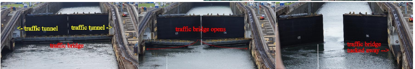
Operation of the old canal traffic bridge as seen from an educational cruise ship (Semester At Sea) on 24 December 2013. (same lock gates, 05 and 06, as on first page of this report and upper left of this page)