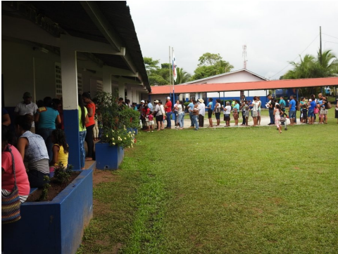
people waiting for us and government