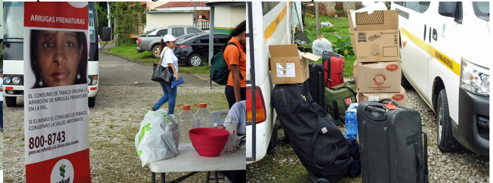
tobacco use ages the face prematurely supplies waiting for room assignment