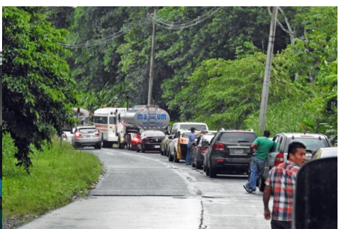
Stopped traffic because of flooded streets in Colon. It took us 4 hours to return to MIT dorms from the Escobal clinic on Thursday.