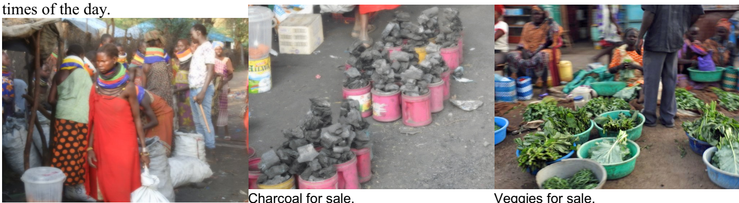
Turkana vendors, bags of charcoal.

This image has the same Google Earth satellite image mostly from 2021 and our red travel route. A similar image was captured for 26 December 2003. Inhabited areas in 2003 are colored yellow. Those in 2021 are colored cyan. Some of the 2003 areas were destroyed by later river relocations during floods. The yellow and cyan colors show the growth of the refugee camps in the upper left, and the likely increase of local Turkana and other Kenyan residents across the bottom. I recall hearing that there are about two hundred thousand refugees in the camps in Kakuma. Most are from South Sudan and Somalia, with some from other countries. In the Somali refugee areas there are mosques in several locations giving loudspeaker calls for Muslim prayer at appointed