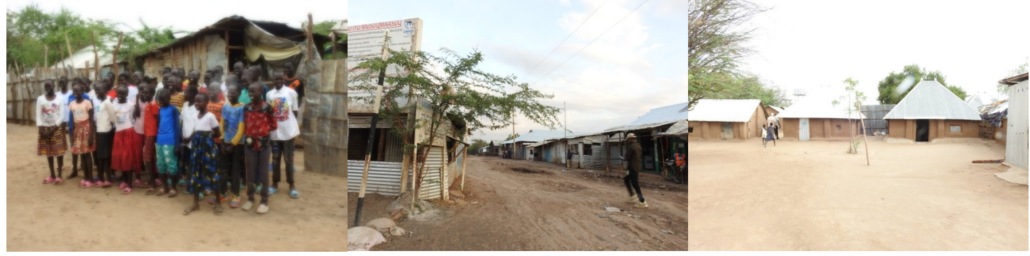
Future Seeds students, rear dwellings. Many refugee structures are metal-clad. Some refugee homes of UN materials.