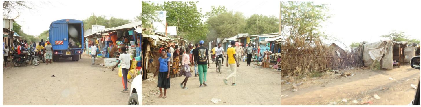
Truck dispensing cabbages.