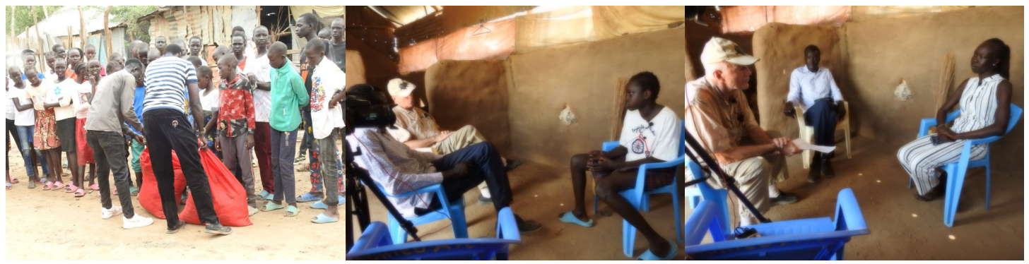
Passing out simple gifts from Colorado. A video interview with a future student. This Seeds graduate is now a teacher.

Our main mission in Kakuma was to document aspects of the program of Seeds of South Sudan there and to interview both graduates of the Seeds program and potential future Seeds students. They are orphans and will need to be housed, fed, and educated in Nakuru and beyond for many years. After graduation they are strongly encouraged to return to Kakuma and South Sudan to serve the needs there. Students are recommended by South Sudanese community leaders and become students only if financial sponsors can be found in America.