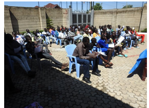
Sunday worship at Home Base, Nakuru

Our third Sunday, 18 September, was at Home Base in Nakuru, the home of the Seeds of South Sudan students. The students are strongly Christian and sing and pray easily and often. Our visiting team had an informal worship and testimony service with them. One evening we tried to show Jesus Film Shorts and commercial movies with the projector and screen that we were donating to them. But that showing failed because an amplifier was needed for better sound. After a good amplifier is found, the movies and teachings of all types can be played for the students.