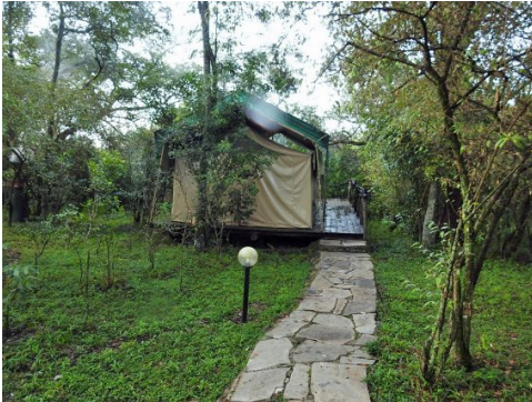
My tent at Maasai Mara.

The following Sunday, 11 September, we were on a safari in remote Maasai Mara. My tent for two nights was located at S 01 26.453', E 035 04.070', more than 50 miles from villages and roads.