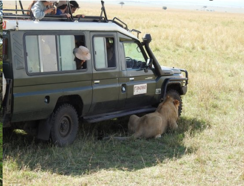
A shade-loving lion.