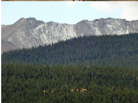
Renamed Mt. Blue Sky with snow, to S View to southwest

There is a good view of the mountains and aspen colors from this second stop. We always stop here and take photos of the group and scenery.