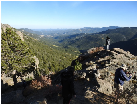
2019 view towards Denver

The fourth stop was at an overlook of the valley east of Echo Lake. These older photos are from our usual view point. This year we went to the top of the rocks at the left edge of the left photo and got a special treat. Below our usual viewing spot were two white mountain goats that would have been difficult to see from above.