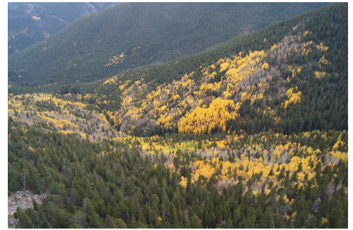
2017 view looking down

The fourth stop was at an overlook of the valley east of Echo Lake. These older photos are from our usual view point. This year we went to the top of the rocks at the left edge of the left photo and got a special treat. Below our usual viewing spot were two white mountain goats that would have been difficult to see from above.