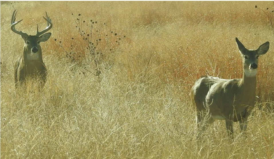
Mule Deer: buck focused on doe