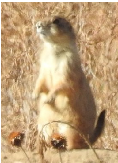
<- Prairie Dog