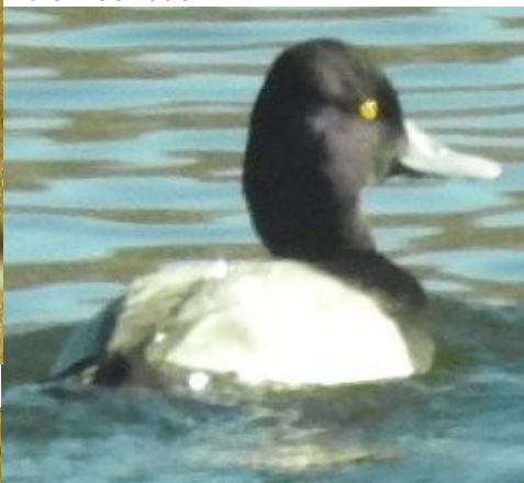
Lesser Scaup duck