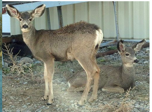
Mule Deer fawns