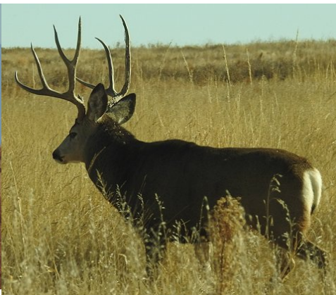
Mule Deer buck