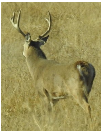
White-tailed Deer buck