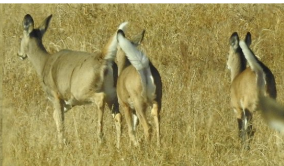
White-tailed Deer does, running - tails high