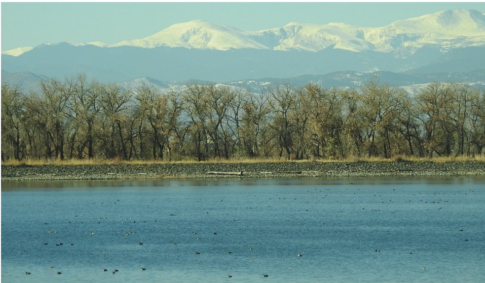
Pond with ducks