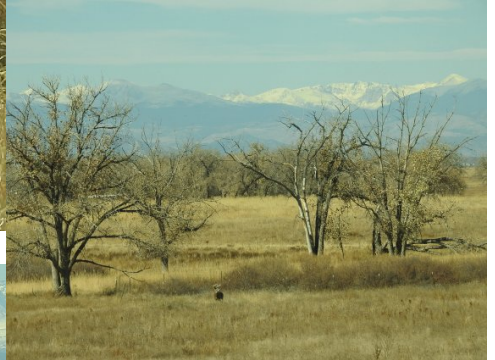
Mule Deer buck (dot) and view