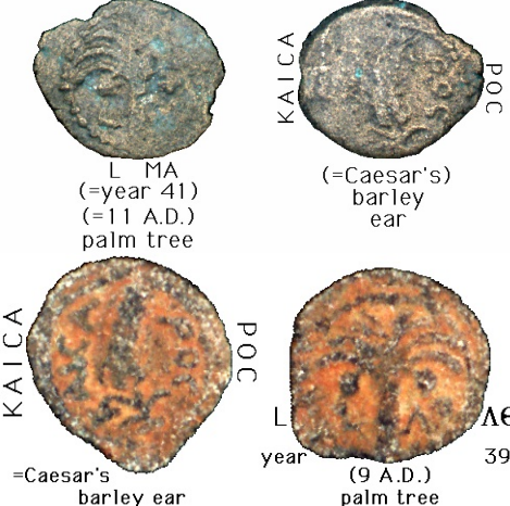
Po C ar's) ey