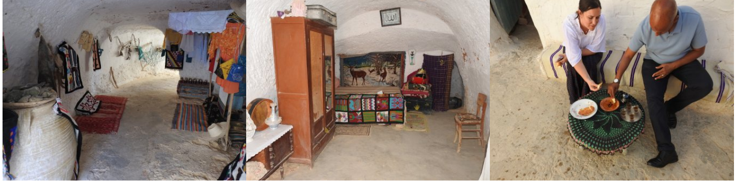
Entrance tunnel is curved for privacy

Our guide apparently has an agreement with this family to show off their unusual home style. He is standing on the concrete roof in the middle photo. The rock is soft and easily eroded in heavy rains, so the concrete roof limits damage. The ground floor is slanted to let rainwater drain out. The underground rooms have nearly the same temperature all year - cool in the Summer heat and warm in the Winter cold.