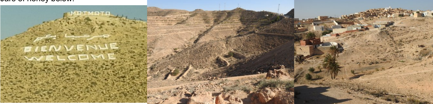
Welcome signs to Matmata