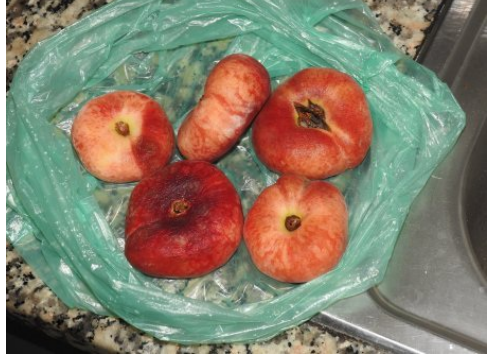
Peaches are flat. Top one tilted up.

After the road direction changed from northeastward to northwestward, and where the road was about to cross that tan area, we stopped at the Zaouiet El Anes Hot Springs water well. The water rose from hundreds of meters below the surface. It was fresh, not salty, and was too hot for irrigating crops. The heat was nearly at the limits of what my hand could tolerate. So nearby there were special spiral mounds by which the water would be cooled by evaporation and radiation.