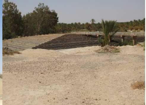
Spiral pyramid for further cooling of the hot water.

The gray area on the map between Douz and Tozeur is near sea level. At times of abundant rainfall it becomes Tunisia's largest lake. After the water evaporates, there are salt deposits that are mined (right satellite image). The salt is exported to Europe to melt snow off roads.