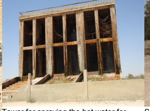
Tower for spraying the hot water for initial cooling.