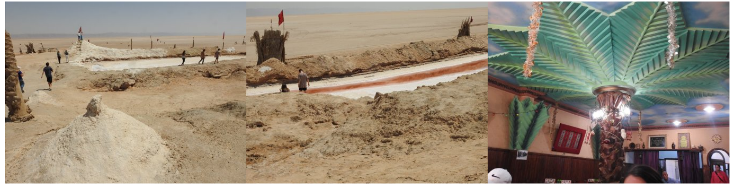
Salt mounds and our team members