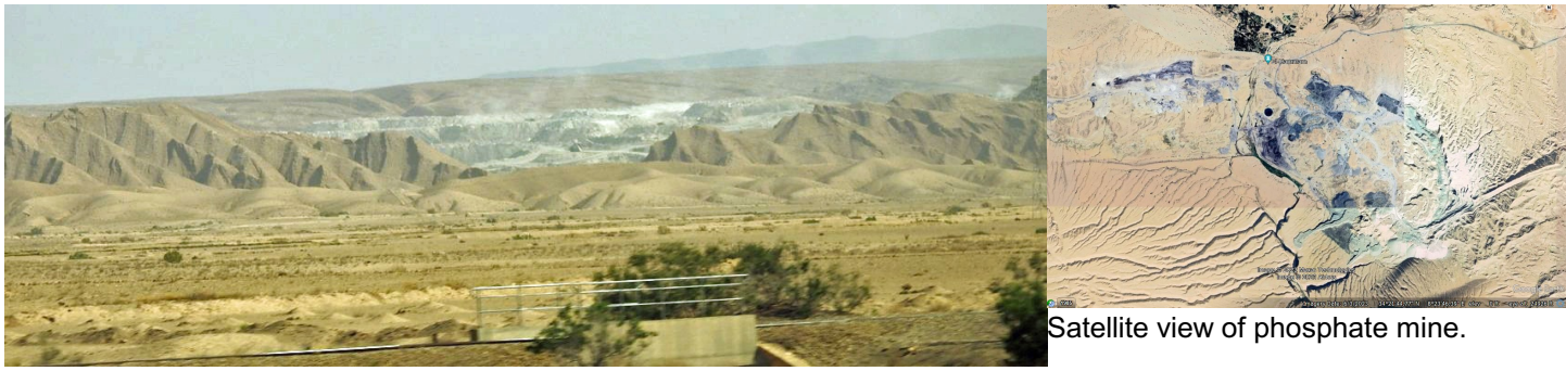
Phosphate mine as viewed from the main highway.

This mine is a major resource for Tunisia and its export market, though it causes pollution problems at the processing plant on the Sea coast.