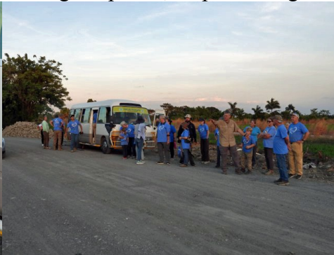
We all got out of the bus