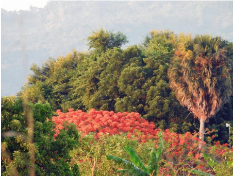
Some area trees had bright red flowers