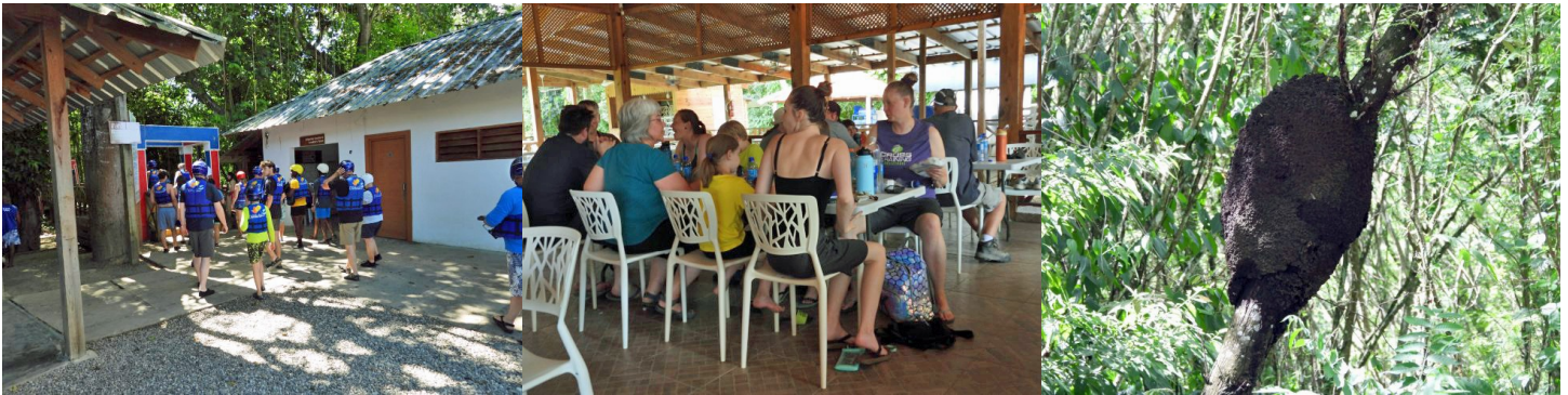
Departure for the water adventure