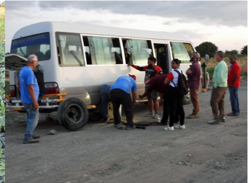
Nearly done with tire change