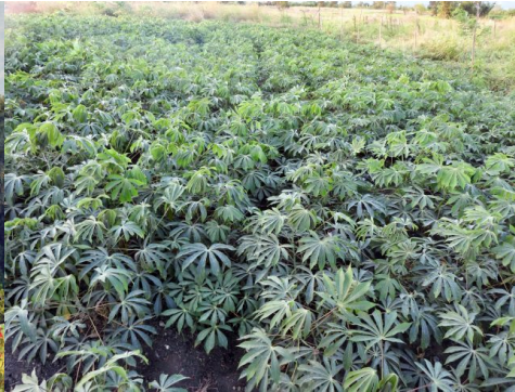
A field of casava