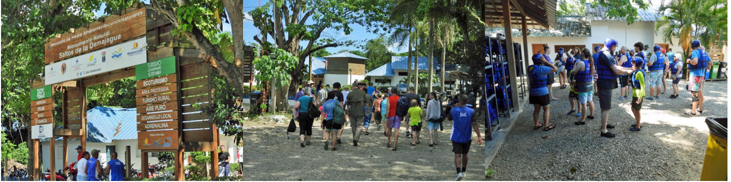
Entrance to "27 waterfalls"

Thursday: The team had an excursion to a tourist area at which people equipped with helmets and life jackets would slide down a series of tight waterfalls and water chutes. (Photos and videos were made by others.)