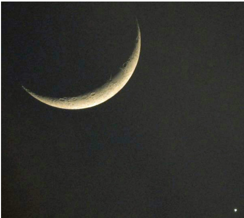
Moon and Venus