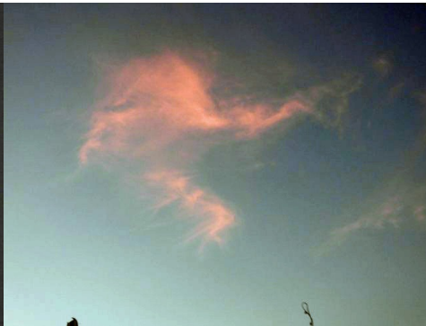
Cirrus cloud at sunset after our ideal weather for building the home

As the sun was setting it gave an opportunity for more area photos.