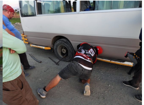
Bus driver using jack and local tools